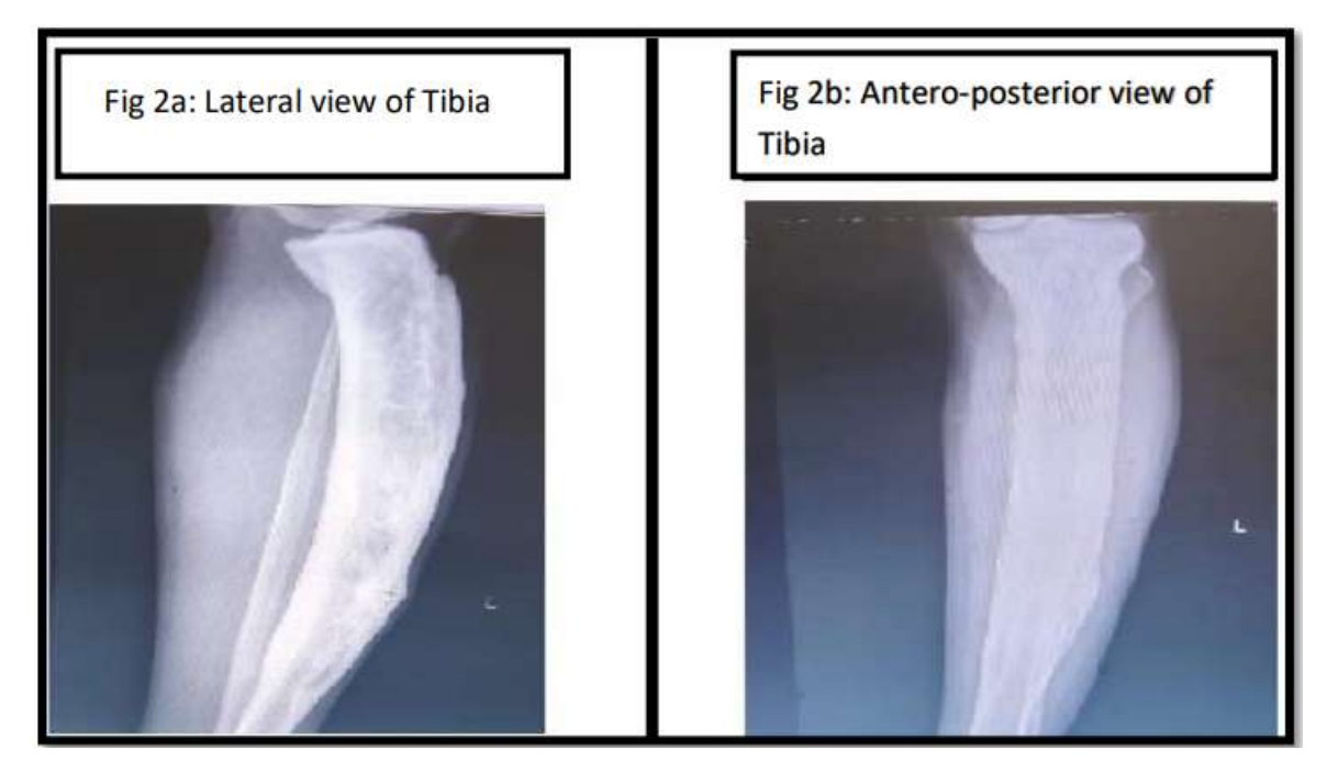
Fig 2: X- ray of left tibia in the antero-posterior axis and lateral axis